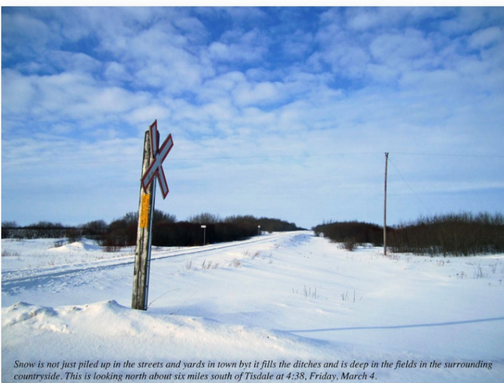
Snow is not just piled up in the streets and yards in town but it fills the ditches and is deep in the fields in the surrounding countryside. This is looking north about six miles south of Tisdale at 4:38, Friday, March 4.