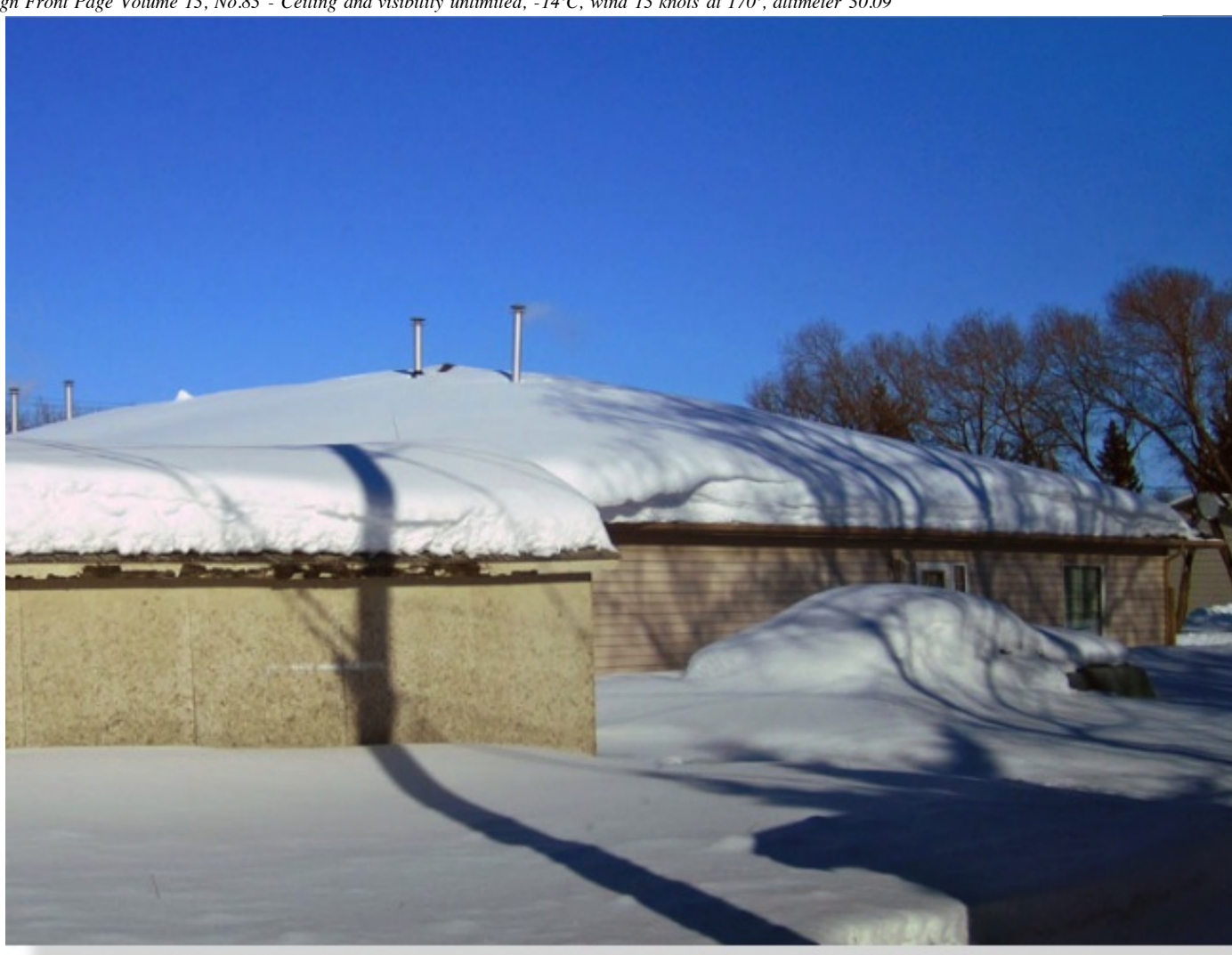
A snow cover yard ,car and house in Tisdale, Sunday, March 6 at 3:41