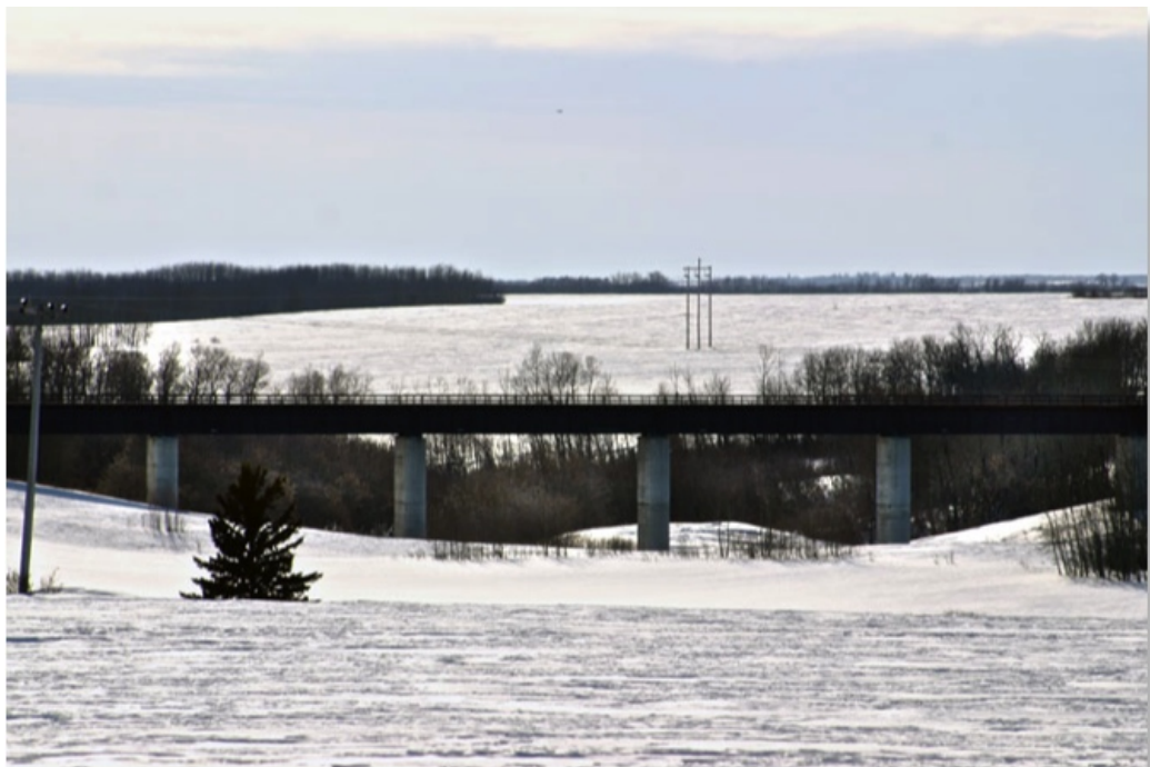
North of Tisdale, Friday March 22, 2013 at 4:49 in the afternoon