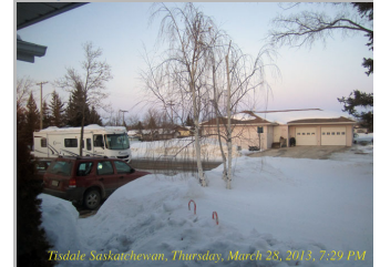
Ensign web cam is out of service this is a still from this afternoon