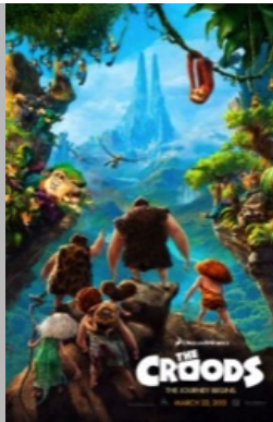
The Croods (PG) ****