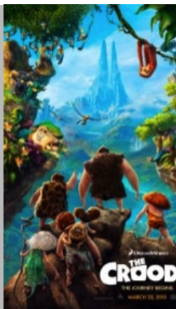
The Croods (PG) ****