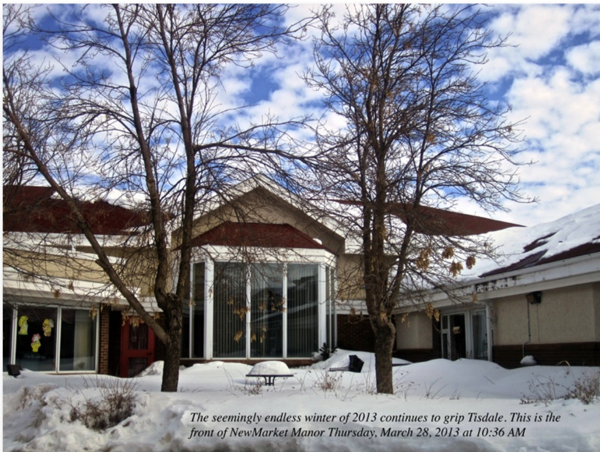
The seemingly endless winter of 2013 continues to grip Tisdale. This is the front of NewMarket Manor Thursday, March 28, 2013 at 10:36 AM

North Central Internet News is a product of