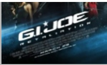
G.I. Joe: Retaliation (PG_13) **