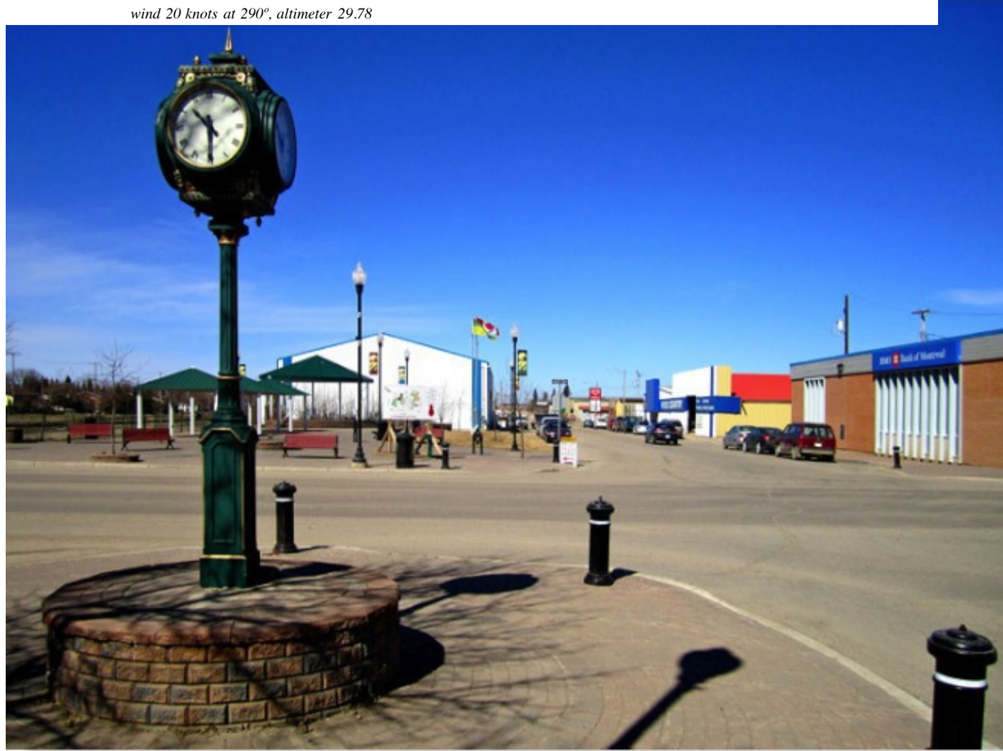
Tisdale's clock, Thursday, April 28 at 10:32. Ensign will not be able to post during the week of May 11 due to a road trip