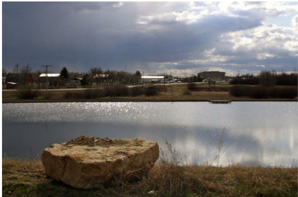
looking west toward Tisdale from the trout pond at 4:34 PM Monday, April 30, 2012