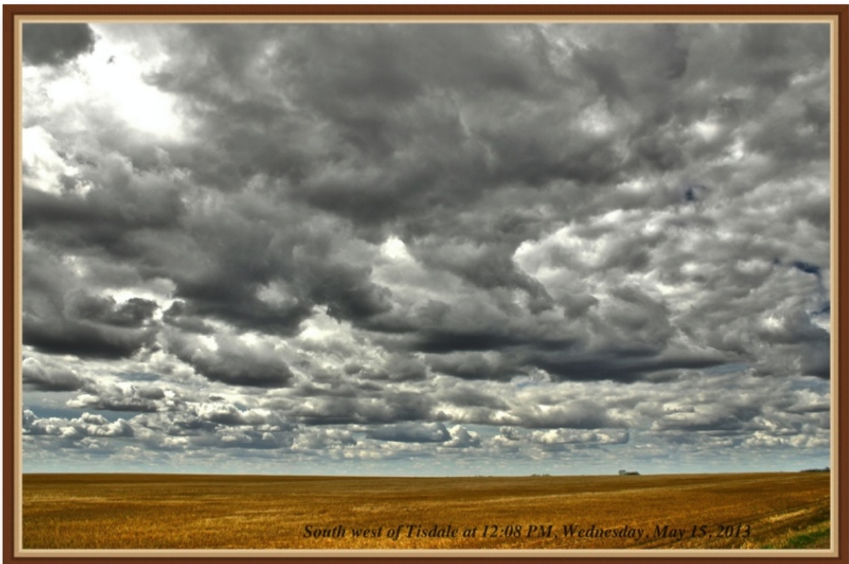
South west of Tisdale at 12:08 PM, Wednesday, May 15, 2013

North Central Internet News is a product of