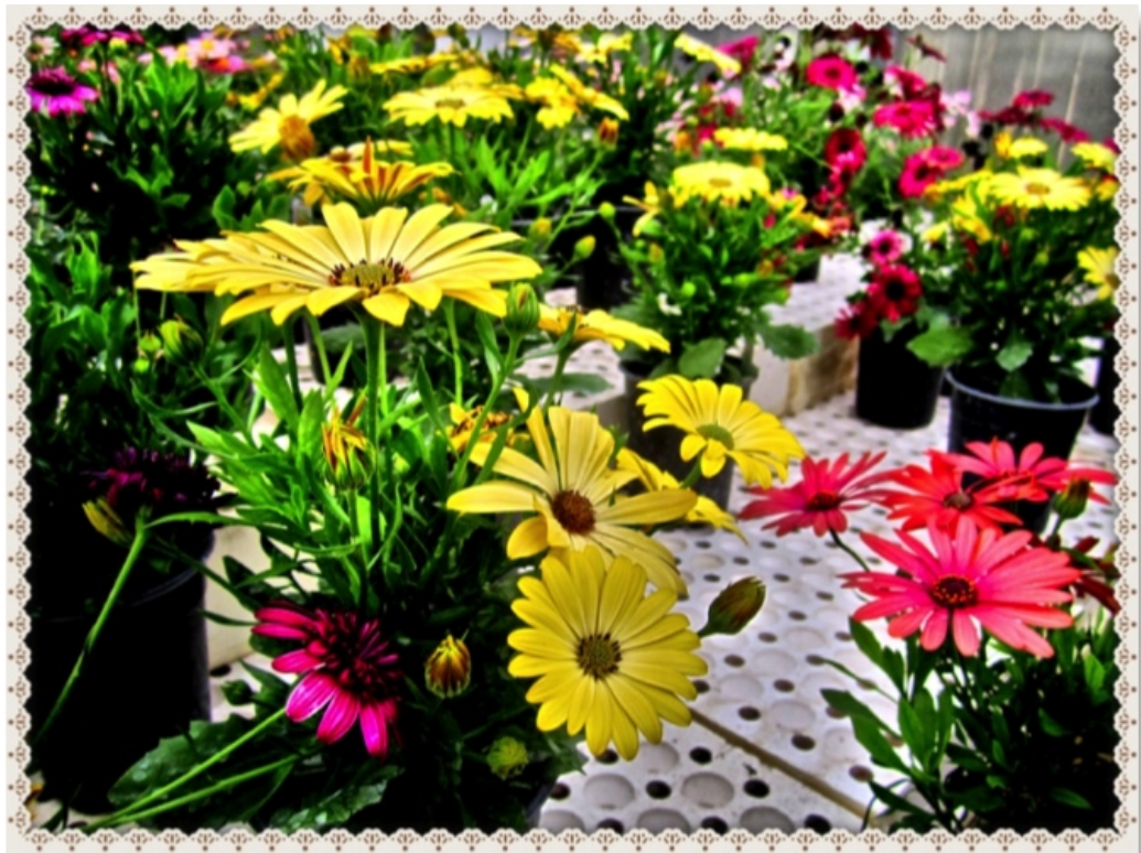
The glory of flowers as seen at the Four Seasons Greenhouse west of Tisdale on Friday May 24, 2013