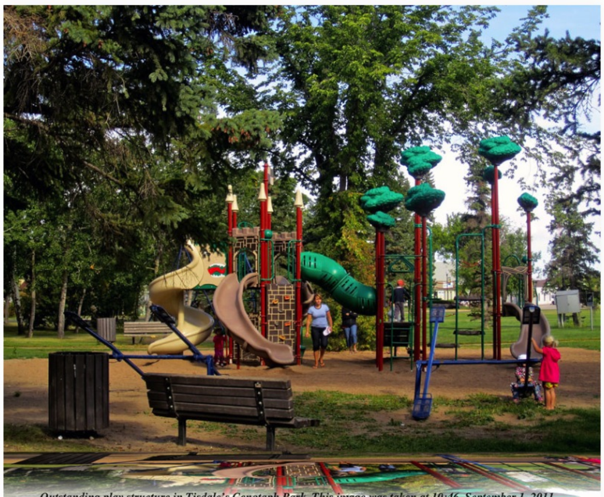
Outstanding play structure in Tisdale's Cenotaph Park. This image was taken at 10:46, September 1, 2011