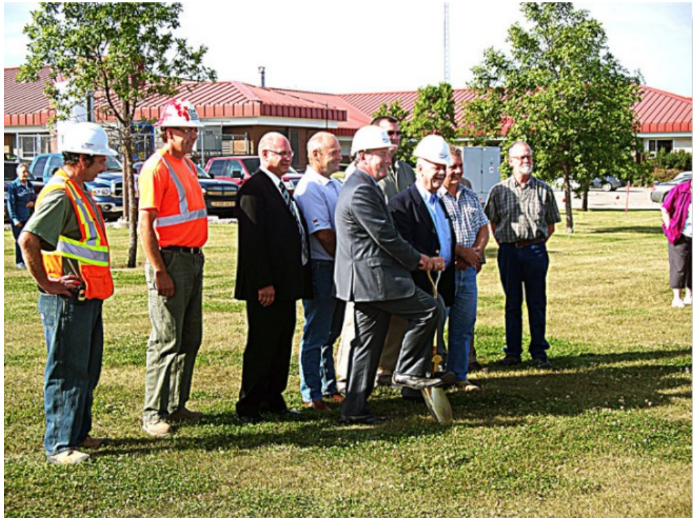
Health Minister Don McMorris launches the new Tisdale long term care facility construction project at 10:24 am Tuesday, September 6, 2011