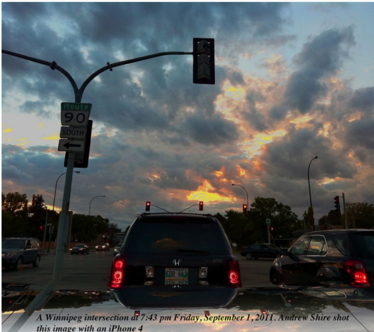
A Winnipeg intersection at 7:43 pm Friday, September 1, 2011. Andrew Shire shot this image with an iPhone 4