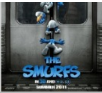
The Smurfs (G)***