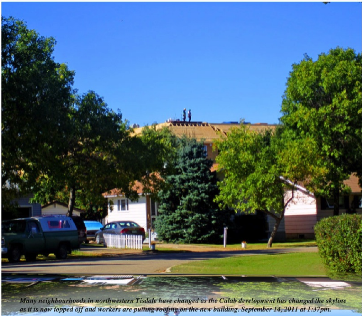
Many neighbourhoods in northwestern Tisdale have changed as the Calab development has changed the skyline as it is now topped off and workers are putting roofing on the new building. September 14, 2011 at 1:37pm.