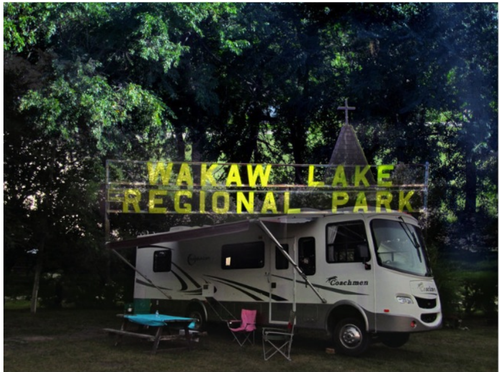
A composite image of our campsite at Wakaw Lake Regional Park and the entrance sign, at 7:40 pm Wednesday, September 7, 2011