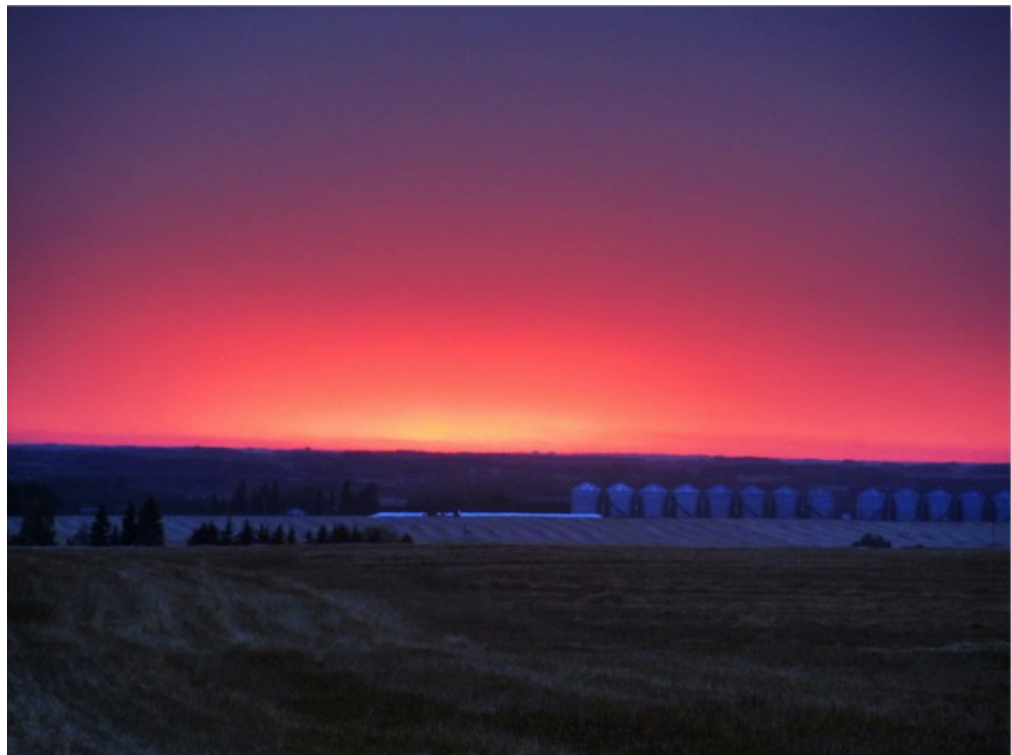
Terry Bilash caught this sunset near Tisdale with his Canon PowerShot SX130 on September 19, 2011