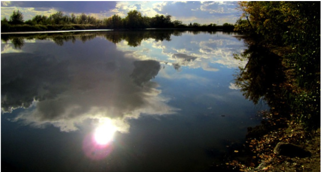
Judy Shire captured this image on the hiking trail around Kindersley's Regional park at 4:50 in the afternoon of Saturday, September 17, 2011.