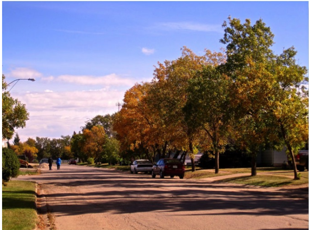
Many of Tisdale's streets still have green trees but this one has coloured trees. Monday, September 17, 2012 at 1:47 PM.