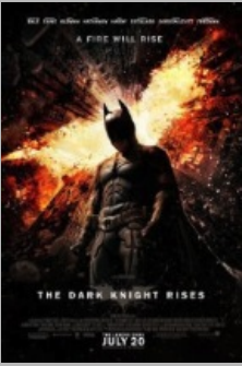
The Dark Knight Rises (PG-13)**