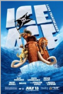
Ice Age 4: Continental Drift (PG-13)**