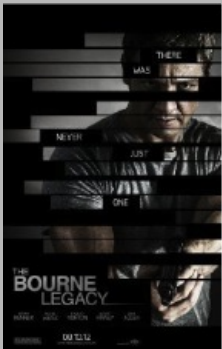
The Bourne Legacy (PG-13)***