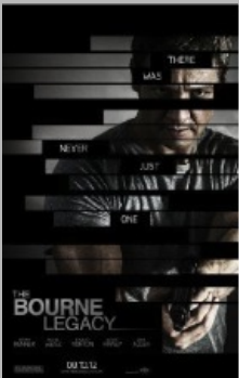
The Bourne Legacy (PG-13)***