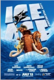
Ice Age 4: Continental Drift (PG-13)***