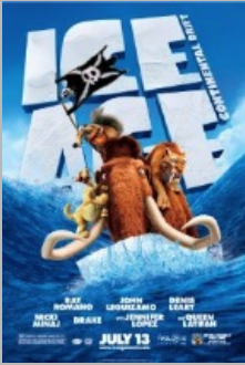
Ice Age 4: Continental Drift (PG-13)***