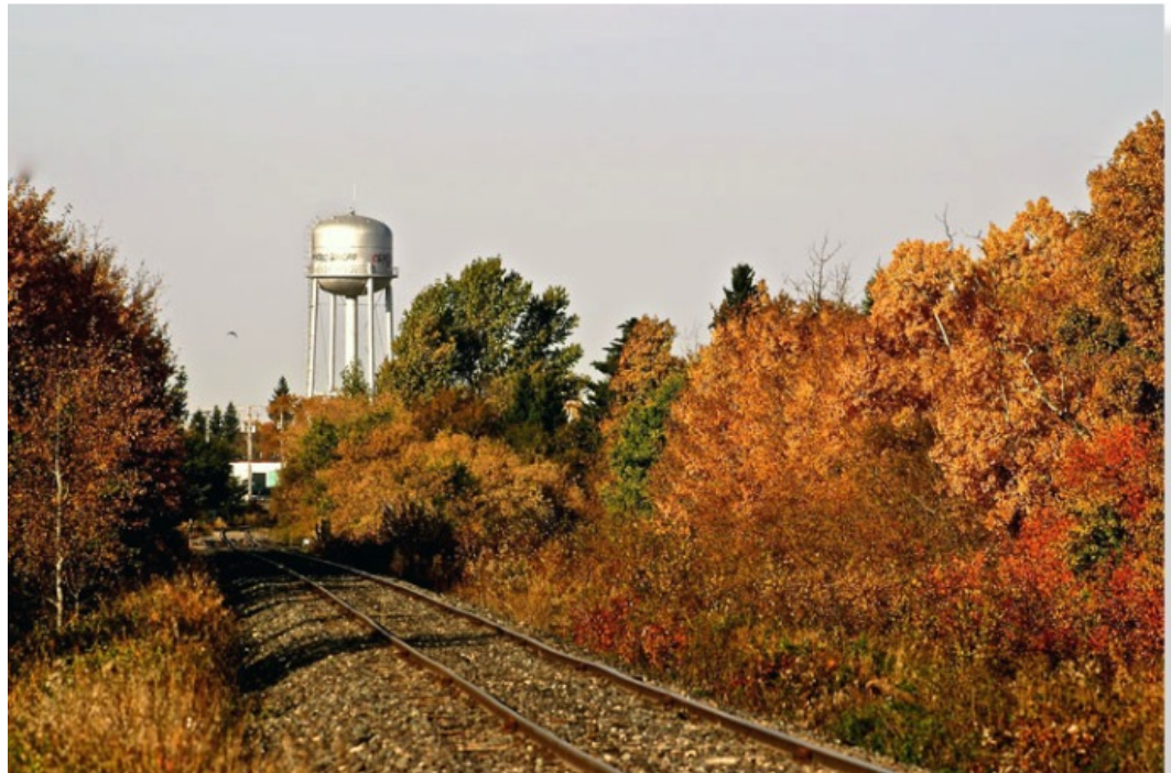
CN line as it leaves Tisdale on the east side by Riverside Golf Course. Monday, September 28, 2012 at 9:21 AM.