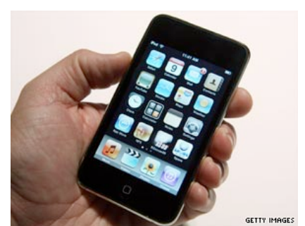
At HEC Paris, MBA students are given an iPod Touch so they can download podcasts of lectures.

LONDON, England (CNN) -- The wisdom of business professors, once only available to MBAs and business students, can now be accessed by anybody with an Internet connection.